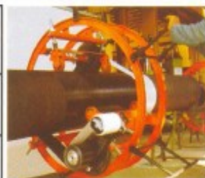
AVT Series Mod. A.