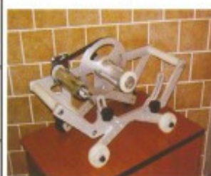
CWI series Mod. EMT6