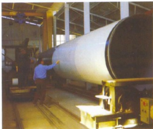
Water pipe (Acqueduct) diam 1600 mm. Altene Rp2 plant system

For further information regarding systems or products and in case of specific projects please contact the ALTA ALTENE technical service